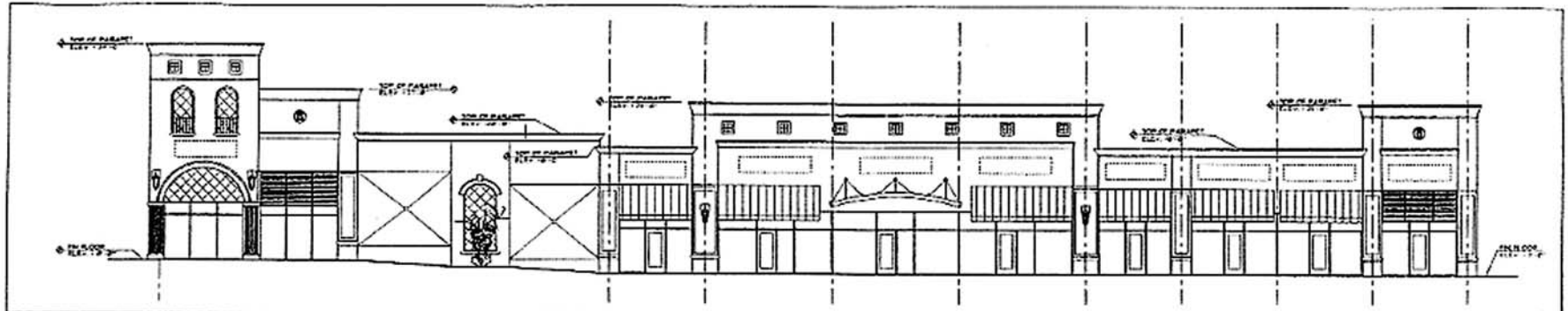
NORTH ELEVATION (RETAIL 'B')